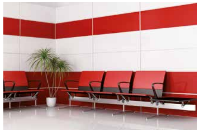
→ PUBLIC BUILDINGS